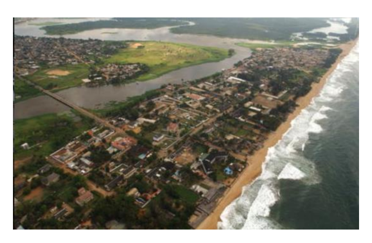
Aerial view of Grand Bassam

Nestled along the Atlantic coast of Côte d'Ivoire, Grand-Bassam is a city steeped in history, culture, and natural beauty. Once the French colonial capital in the late 19th and early 20th centuries, this charming town today offers a unique blend of faded colonial architecture, palmfringed beaches, and vibrant local life that draws visitors from around the world.